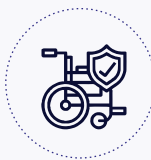
LTD & Workers Comp