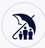
Life & Health